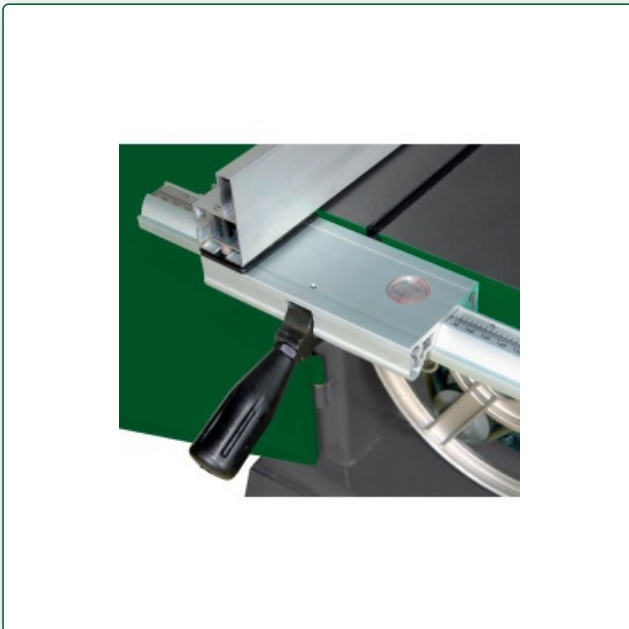
Aluminum rip fence with eccentric quick-clamping, easy and precise sliding, set value conveniently readable on millimeter scale.