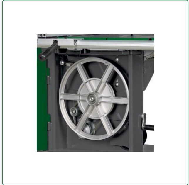
Manual speed adjustment in two stages by folding the belt. Drive wheels for clean running surfaces equipped with chip brushes.