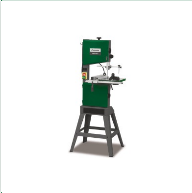
Illustration shows HBS 261-2 with optional accessory circular cutting device (5912426)