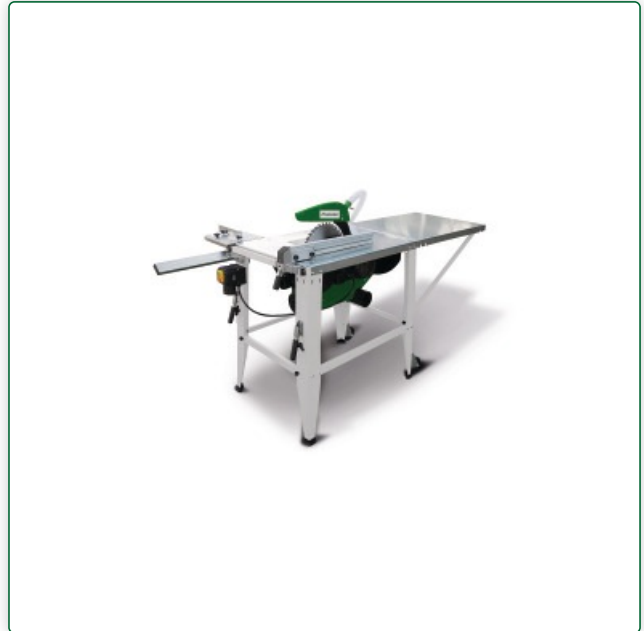
Illustration shows miter fence with aluminum profile, profile available as accessories