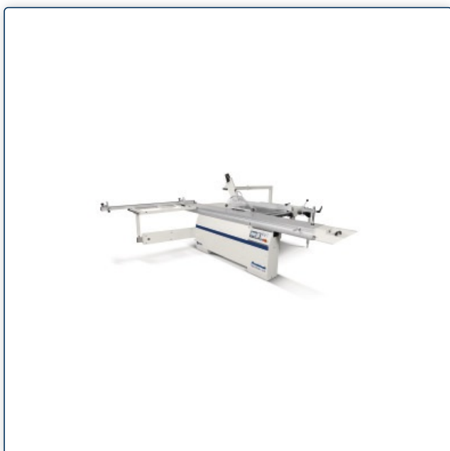
Fig. shows the position of the operating panel of models A / A3