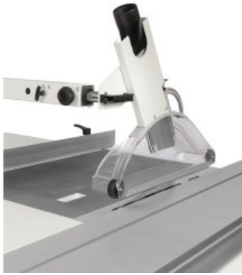
Saw blade pendulum guard